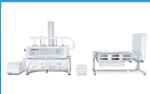
The DT 828 with optional automated sampling station controls offline system

Technical specifications of products described are stated without warranty and subject to change any time without further notice.