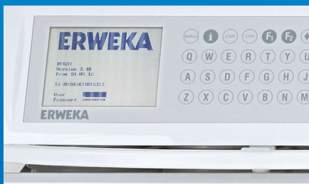
The DT 820 series comes with built-in intelligence like large memory and system suitability tests