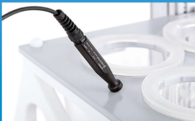
Electronic temperature sensor for permanent check of bath temperature