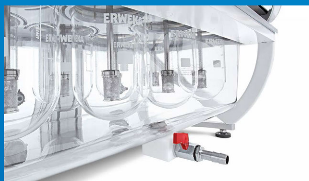
Easy to clean one-piece moulded water bath with outlet valve