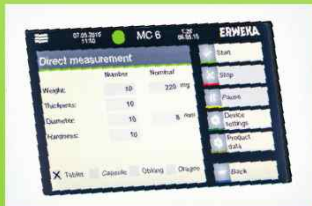
Direct measurement menu for quick starting tests.